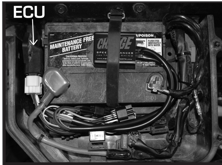
Figure 2 Mounting the MSD Charge.