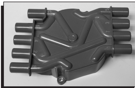
Figure 2 Distributor Cap.