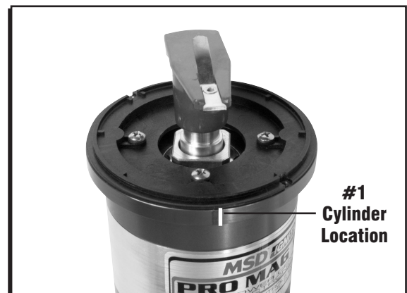
Figure 2 Positioning the Rotor Tip.