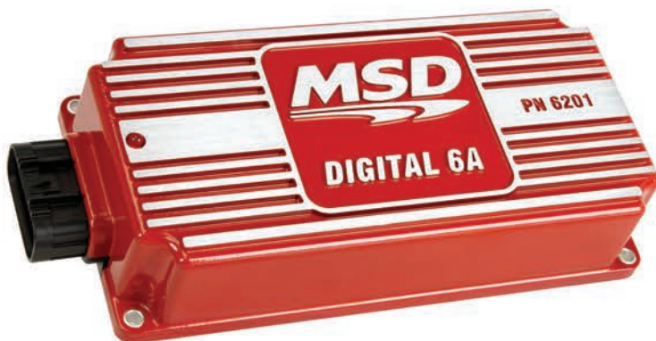
DIGITAL 6A, PN 6201

Wiring is the same as other MSD Ignitions while the single connector provides a cleaner installation.