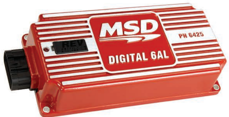
DIGITAL 6AL, PN 6425