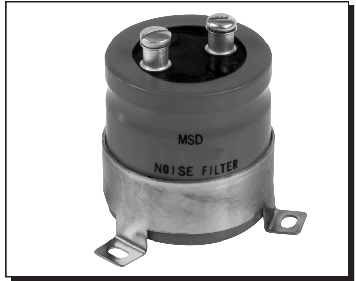
Figure 2 - MSD Noise Filter, PN 8830.

The Noise Capacitor will act like a filter on the heavy power supply wires of the MSD. The MSD will draw its power through the filter keeping all of the other accessories separate which prevents supply line noise. A side benefit is that the Capacitor will protect the MSD Ignition from voltage spikes or current surges.