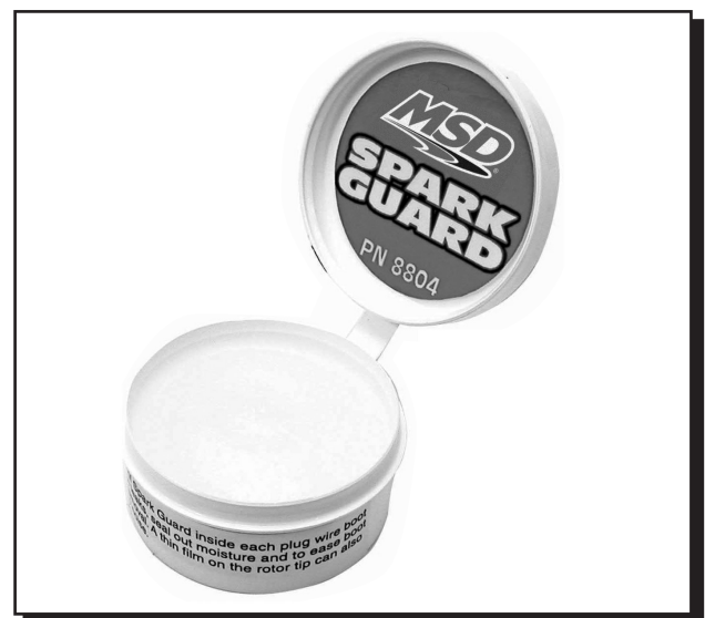
Figure 1 - MSD Spark Guard, PN 8804.

MSD offers a dielectric grease called Spark Guard. It is available as PN 8804. This grease reduces the chances of voltage leaks which can cause radio noise. Plus, it helps with plug boot installation and removal while preventing any chance of moisture build up inside the boot.